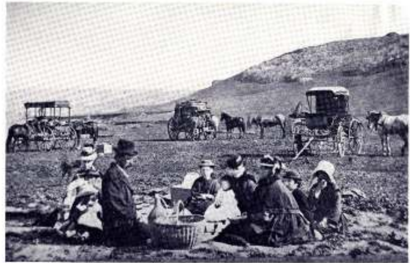
A PICNIC AT THE COVE in what is now Scripps Park, probably taken in the late 1870's. From a stereoscopic view.